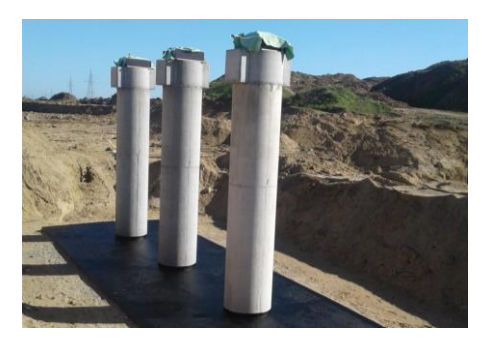
Construction of bridge structures and production of concrete at the construction of the S61 Via Baltica expressway running from Warsaw to Tallinn in Estonia