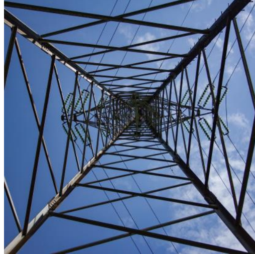
Construction of double-circuit OHL 110 kV within the project "Acceleration of constr-on of EPS facilities of Tashkent Cotton Textile LLC"