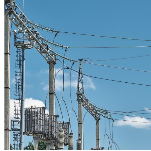
Construction of Turakurgan TPP with taps of OHL 220-110 kV