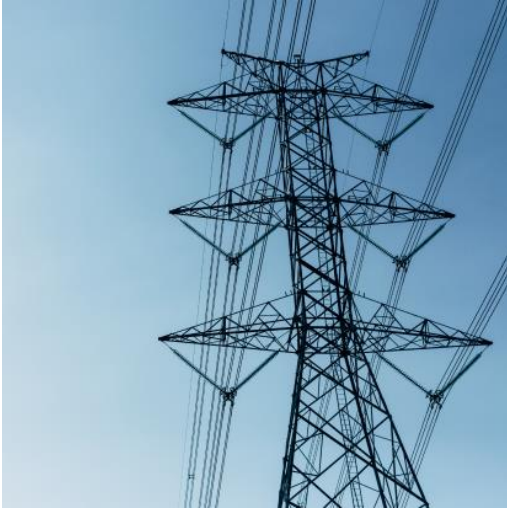
Construction of double-circuit OHL 220 kV from Sirdaryo TTP to Pechnaja SS and Metallurgiya SS