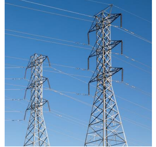
Construction of 110 kV OHL EPS of the special industrial engineering and electrical hub in Andijan district of Andijan region according to PQ-271

The above is to show only some of the numerous ventures undertaken by RESBUD Group Companies.