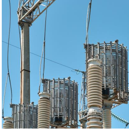
Construction of OHL 500 kV Surkhon SS – Khoja SS – Alvan (on the territory of the Republic of Uzbekistan)