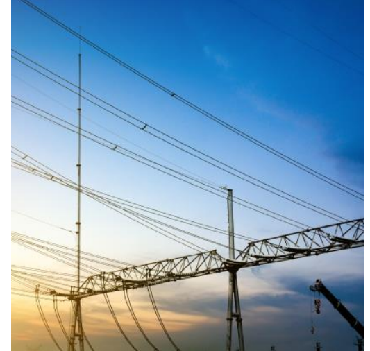
Construction of OHL 110 kV and part of SS Suffa 110/35/10 kV within the project of EPS of tourist recreational zone "Zomin"

The above is to show only some of the numerous ventures undertaken by RESBUD Group Companies.